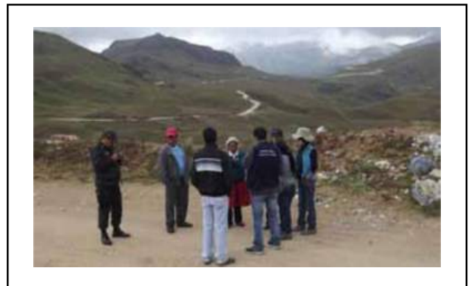
Inspection visit carried out on February 5, 2014, without any "threat" or "harassment".

Yanacocha will continue avoiding any type of confrontation, while protecting the safety of people and ensuring respect for its ownership rights over the land legally acquired by the company for the Conga project.